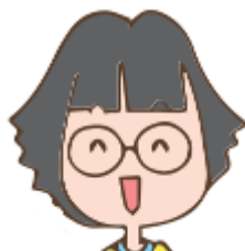
Notes about Emily Foster