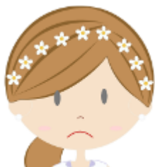
Notes about Beatrice Day